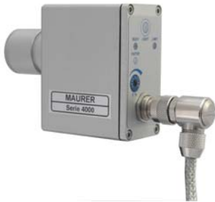
cable socket 90°