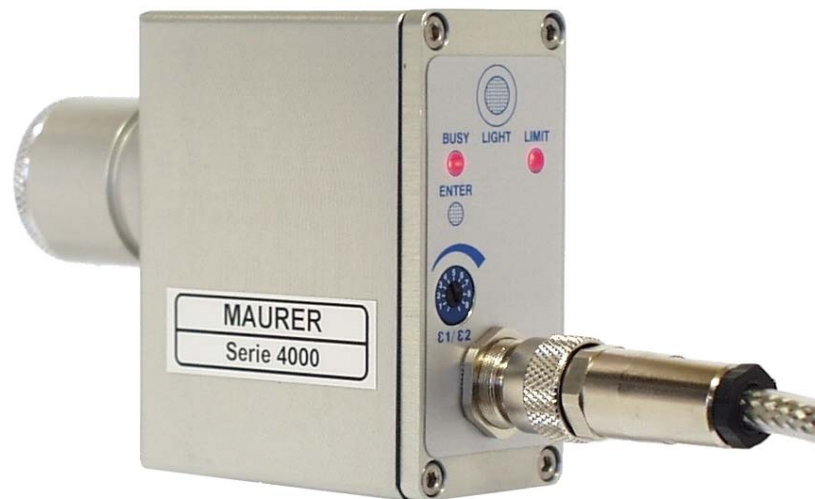
figure approx. M 1:1

MAURER – Infrared – pyrometer can also assist you to monitor your heating processes, ensuring a uniform standard of quality for your products.