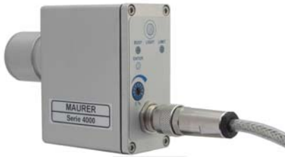
cable socket straight